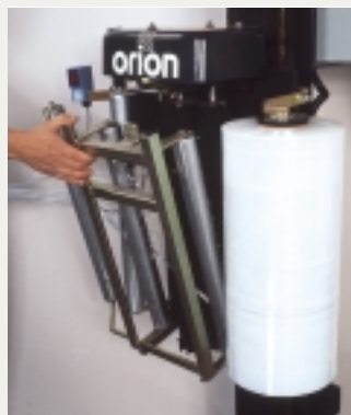
Threading the Insta-Thread LT film carriage is fast and easy: simply open the hinged roller frame, pull the film across, then close and latch the frame. That's it!

The H-77 uses the Insta-Thread™ LT film delivery system is an extremely reliable film carriage engineered to accurately pre-stretch film at a fixed rate and deliver it to the load at a constant tension level.